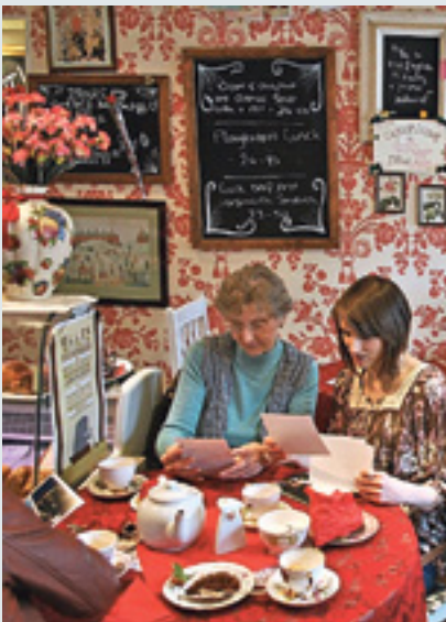
The Sunshine Bakery, Leeds

This is much more than just a tearoom serving scrumptious food (afternoon tea from £13.50, including sandwiches, scones and cakes made on the premises) – it's a chocolate shop and a wonderful bakery, too. The millefeuilles are scrumptious – light, creamy, with strawberries or other seasonal fruit. I was treated to a